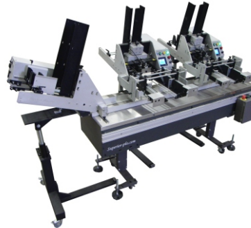
Add a XM-1 for Top Sheet & Backer Card Placement

The robust design and dependability of the Xtreme XM lines make it the best value on the market.