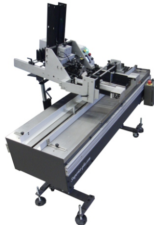
Add a Victory Batch Dropper for inline batch counting

The XM-12 features servo motor technology with an intuitive touchscreen PLC, push button controls, and tool-less setup adjustments allowing for greater uptime and maximized productivity. Easily mount to a Superior-PHS mounting stand for use throughout your entire production and fulfillment area.