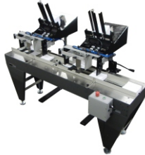
RXSD-2 Batch Count Collator