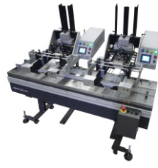
2-Station Batch Count Collator