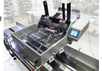
Wide Format up to 30" wide