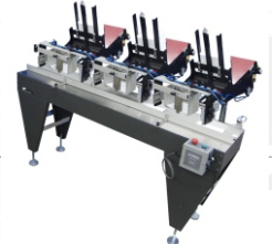
RXSD-3 Batch Count Collator