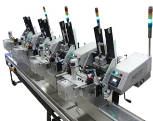
4-Station Batch Count Collator with Dual Stage Droppers

XM Batch Count Collators are the most robust, advanced systems in the world to count, stack, accumulate, collate, and jog your products in high-volume 24/7 production environments. Easily integrate with wrappers/sealers, auto L-bars, strappers, cartoners, and more. Configure one to 50 feeder/dropper stations to feed the widest range of material including product sizes 3" to 30" wide! High customizable to fit your specific needs.