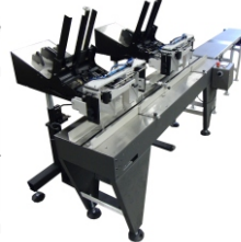
RXSD-2 onto Flat Belt Conveyor