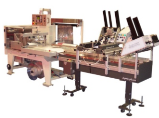
1-Station with Backer Card into Wrapper