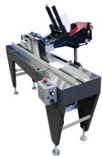
RX-12bc with Victory SD Dropper

Enjoy all the benefits of a fully-automated batch count collating system without breaking the bank! Count, stack, accumulate, and collate at the lowest price on the market. Configure one to 25 RX-12bc/dropper stations to integrate with wrappers/sealers, auto L-bars, strappers, cartoners, and more for products 3" x 3" up to 12' x 12".