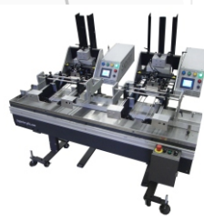
2-Station Batch Count Collator