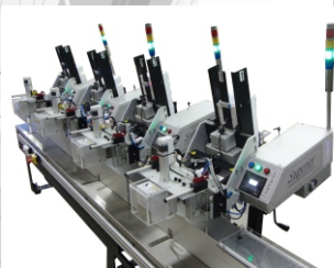
4-Station Batch Count Collator with Dual Stage Droppers

XM Batch Count Collators are the most robust, advanced systems in the world to count, stack, accumulate, collate, and jog your products in high-volume 24/7 production environments. Easily integrate with wrappers/sealers, auto L-bars, strappers, cartoners, and more. Configure one to 50 feeder/dropper stations to feed the widest range of material including product sizes 3" to 30" wide! High customizable to fit your specific needs.