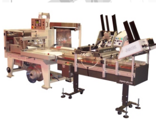
1-Station with Backer Card into Wrapper