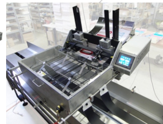
Wide Format up to 30" wide