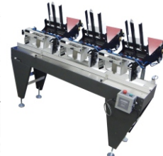
RXSD-3 Batch Count Collator