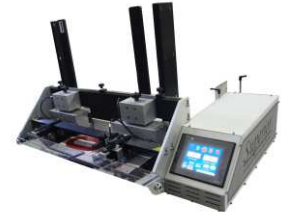
XM-30u Max. Count: 99,999 pieces Max. Speed: 750 ft./min. Products: 2"W x 3"L to 30"W x 12"L