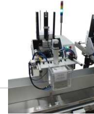
SD and DSD Dropper 3" x 3" - 6" x 9" Jogging options available!