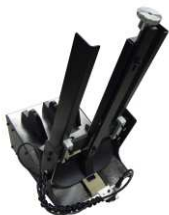
RX-9s Run Modes: Staging, Continuous Products: 2"W x 3"L to 8.72"W x 6"L Great for use on inserters!