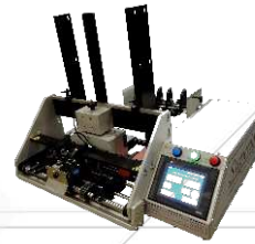
XM-20u Max. Count: 99,999 pieces Max. Speed: 750 ft./min. Products: 2"W x 3"L to 20"W x 12"L