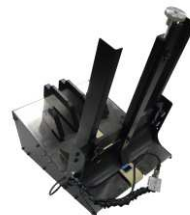
RX-12cs Run Modes: Staging, Continuous Products: 2"W x 3"L to 12"W x 12"L Use with Jumbo Inserters!