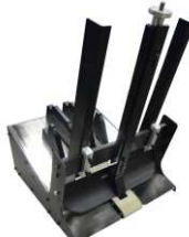
RX-12c Run Modes: Continuous Products: 2"W x 3"L to 12"W x 12"L