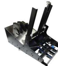
RX-12d Run Modes: One-Shot, Continuous Products: 2"W x 3"L to 12"W x 12"L