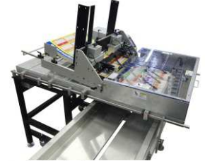
RD Dropper up to 30" wide