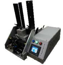
XM-12 Max. Count: 99,999 pieces Max. Speed: 400 ft./min. Products: 2"W x 3"L to 12"W x 12"L