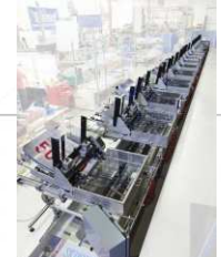
XM Wide Format