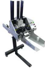
BT-II Batching Tray 3"W x 5L" - 20"W x 18"L Offline batch counting