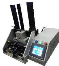
XM-12u Max. Count: 99,999 pieces Max. Speed: 750 ft./min. Products: 2"W x 3"L to 12"W x 12"L