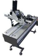
BD Dropper 3" x 3" - 12" x 12"