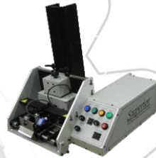
XM-1 Max. Count: 99 pieces Max. Speed: 210 ft./min. Products: 2"W x 3"L to 12"W x 12"L