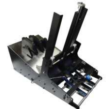
RX-12bc Run Modes: Batch Count, One-Shot, Continuous Products: 2"W x 3"L to 12"W x 12"L