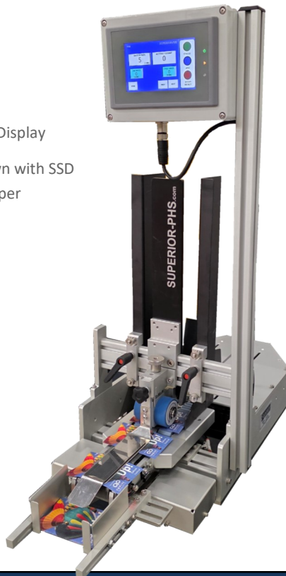
3.5" Display Shown with SSD Dropper