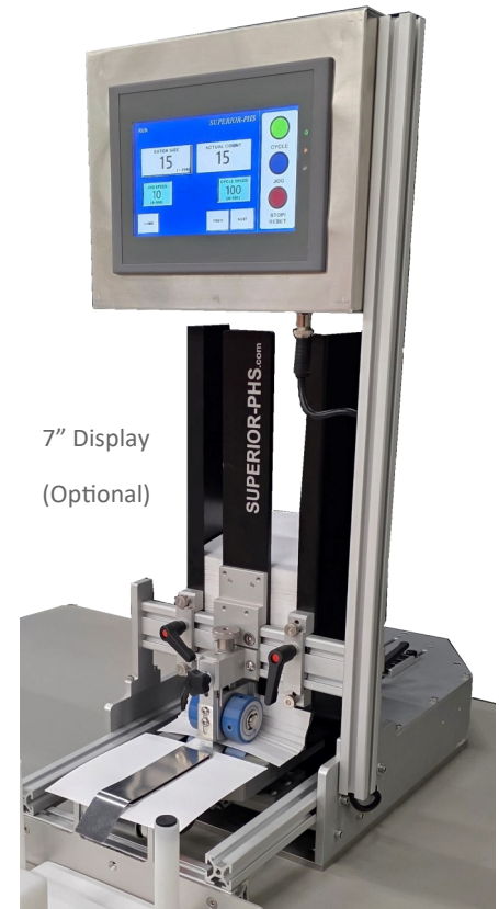
7" Display (Optional)

You can also utilize the optional SmartCount Edge module to provide a secondary count validation and stream the count data to your in-house PC or server for data collection, analysis, and reporting.