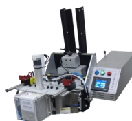
SD & DSD Dropper