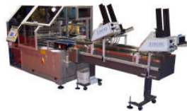
Shrink-wrapper and Poly-wrapper Feeders