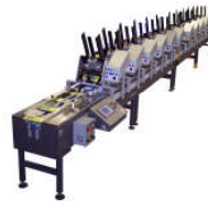
Collation / Kit-Fulfillment