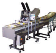
Inline Cover Sheet Placement