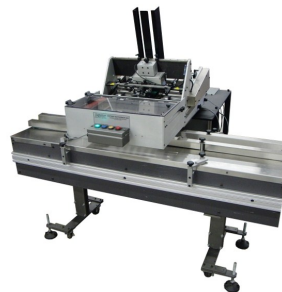
BD-1 with XM-20HS and Victory RD Dropper