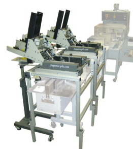
BD-2 System into a shrink wrapper