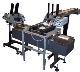
BD-1 with optional XM-100 Bulk Loader and XM-1 stand alone feeder

Fully automated BD Systems (Batch Drop) batch count and drop the set(s) to a Flighted Conveyor to be delivered to the other automated finishing processes including banders and wrappers. Ideal for batch counting one or more unique sets simultaneously, or breaking up a large count set with multiple feeders.