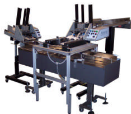
Used in this system as a high-speed batch counting solution

The XM-21 and XM-23 are a great value with many standard operating features including High-Speed Feeding, Auto-Trigger, Batch-Counting up to 999 pcs., and Miss-Product Detect.