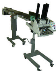
Add stacking capacity with the XM-100 Bulk Product Feeder