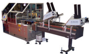
2-Station system with Shrink Wrapper

The heavy-duty, robust design will provide years of dependable service with little maintenance required.