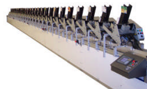
32-Station high-speed system