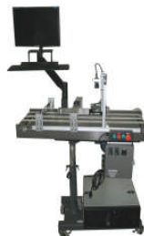
Used in this system as an output verification of pre-printed material