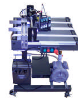
Used in this system as a compact roll in / roll out 2" HP addressing system