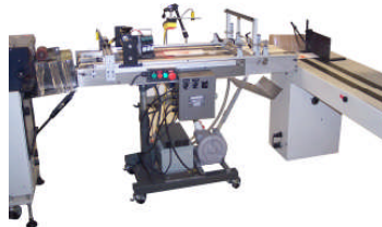
Used in this system as the base for addressing and print verification

Designed with variable speed control, the Vacuum Transport allows you to control the rate of speed for speed-matching to other equipment.