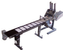
Used in this system to count batches to a flat belt conveyor

Compact footprint. Easily mounts to any machine